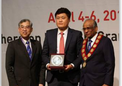
APSS presented the tokens of appreciation to APSS Central Sponsors, DePuy Synthes Johnson & Johnson (left) and Medtronic (right) which are APSS' strategic partners in supporting the mission of APSS.