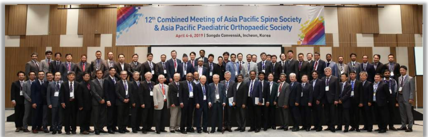
Line up of the distinguished APSS Faculty and members who attended the General Assembly during the 12th Combined Meeting of APSS and APPOS in Incheon, Korea.

Right: Delegates queued up to pose enquiries to the faculty during a Q&A session.