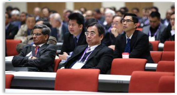
Delegates fascinated by the research results shared by the faculty at the Congress.