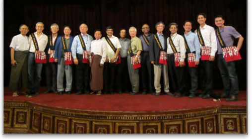
The APSS faculties with the local organising team.