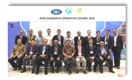
Group photo of the faculty with the local representatives.