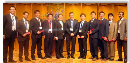
Presentation of certificates to the APSS DePuy Synthes Fellows during the APOA Spine and Paediatric Sessions Combined Congress 2011 in Gifu, Japan

APSS welcomes spine surgery practitioners to journey in accomplishing greater achievements and realising the mission to advance the science, art and practice of spine surgery and promulgate the maintenance of professional standards in order to provide the best professional care to patients with spinal problems.