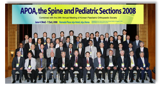
The APOA Spine and Paediatric Sessions Combined Congress 2008 in Jeju, Korea.