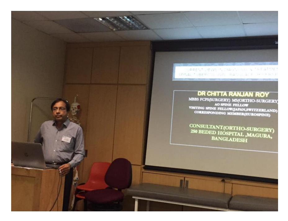
Presenting works done in my own hospital

I also visited the operations of spine diseases performed by other profs.it was a nice experience to watch ,learn ,and assist under the guidance of these professionals. I had the unique opportunity to glance at the modern technique and technology and had the immense pleasure to see some fine piece of masterly work of spine surgery. I took part in spine rounds, weekly spine clinic visit and made one power point presentation on spine tuberculosis management on my own hospital .