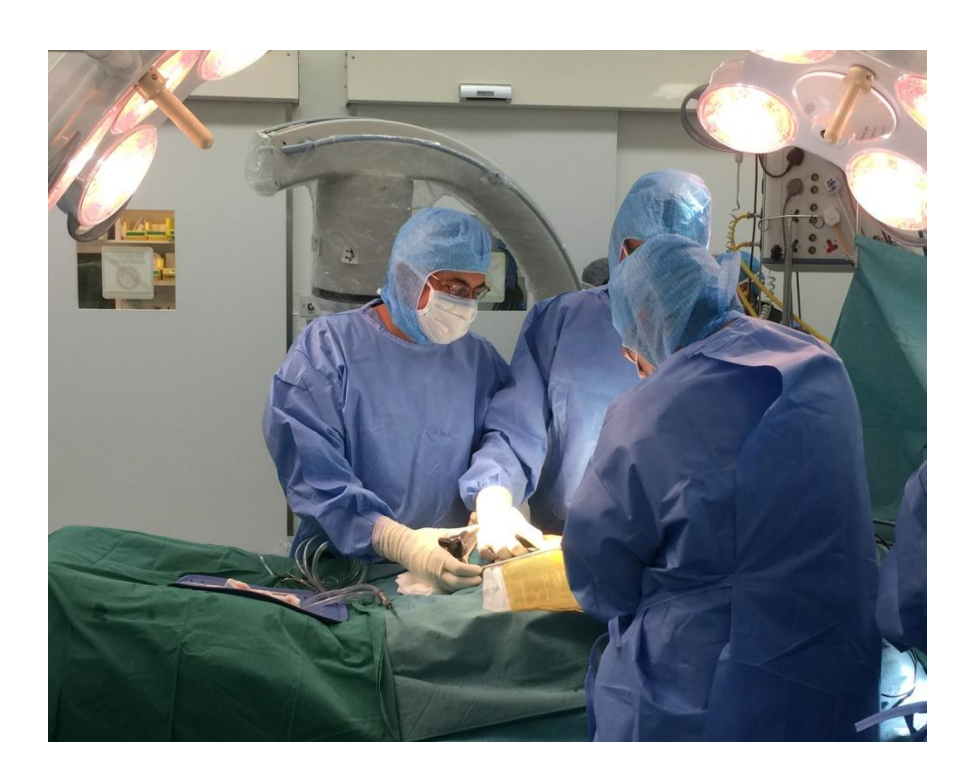
Scrubbing during operation

There was clinical presentation and pre-op and post-op case presentation by the residents followed by discussion on every Thursday .I learned a lot to know how to make decision for every case and what the goal is and reasons behind it.I learned not only the technique but also the idea of management