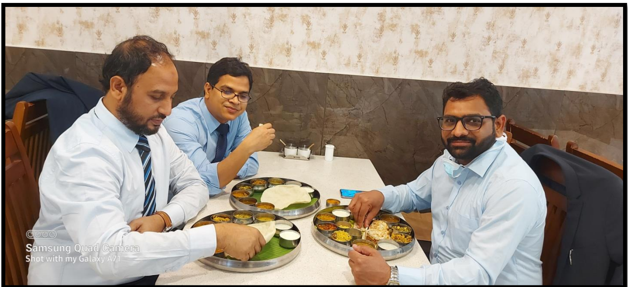
Vegetarian food at “ Aboorva’s restaurant ” - Famous in Coimbatore