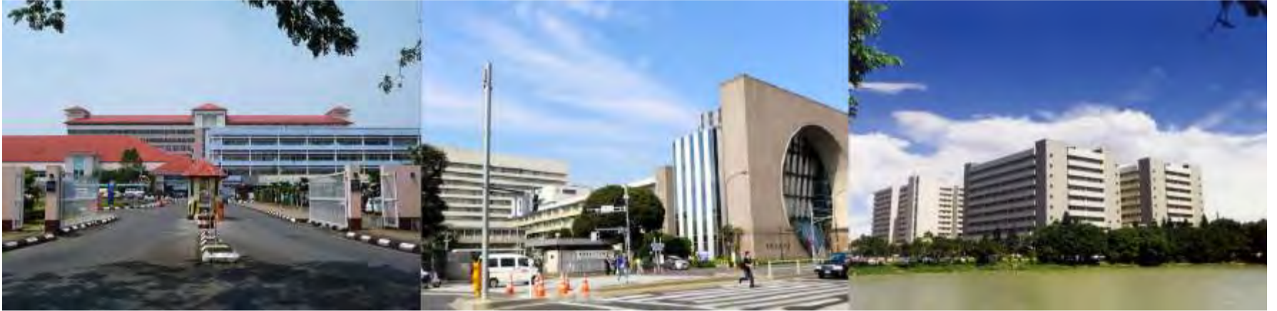
Sarawak General Hospital