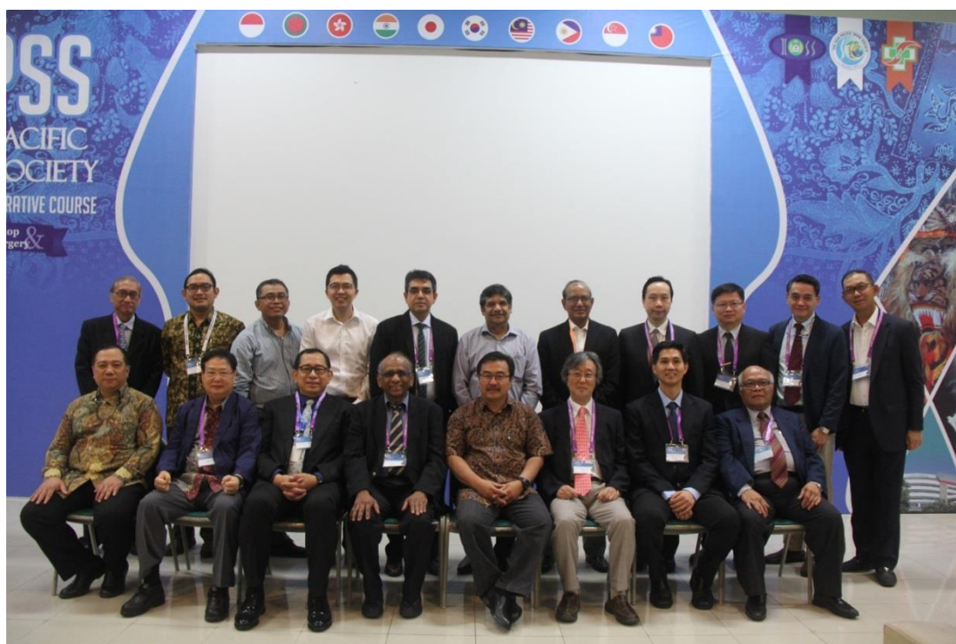
Picture : Faculty Member of Asia Pacific Spine Society and Dr. Soetomo General Hospital Representative