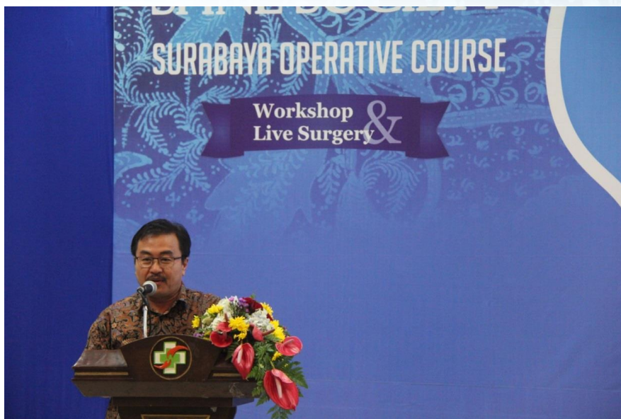
Picture. Opening Ceremony by Director of Dr. Soetomo General Hospital representative