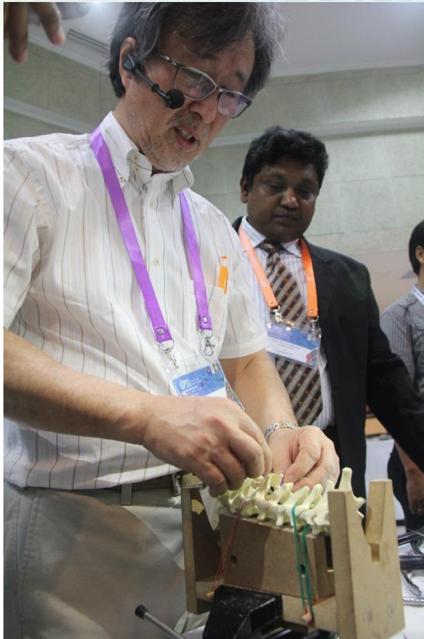
Picture : Prof Kuniyoshi Abumi was giving explanation during the Workshop